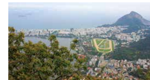
Traffic Control Brazil, Niteroi