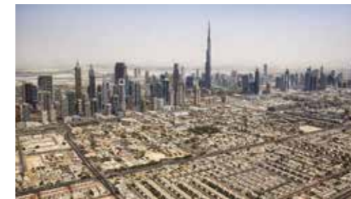
Dynamic Weigh-in-Motion CrossWIM United Arab Emirates, Dubai