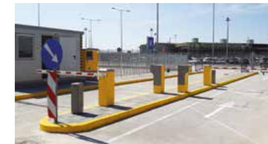
Parking System CrossPark Greece, Thessaloniki