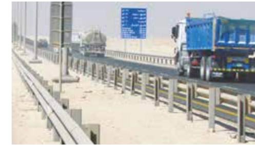
Dynamic Weigh-in-Motion CrossWIM Qatar, Doha