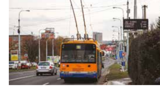
Travel Time Czech Republic, Zlín