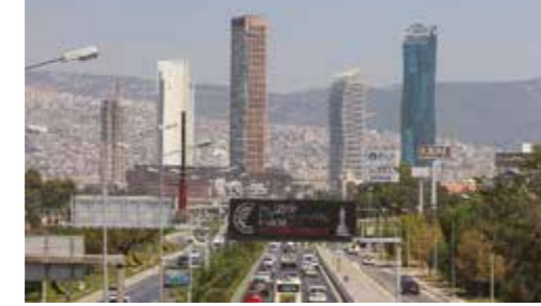
Fully Adaptive Traffic Management Turkey, Izmir