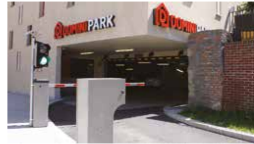
Parking System CrossPark Czech Republic, Brno, DOMINI PARK The winner of the Car Park of the Year 2018 contest