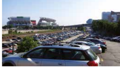
Parking System CrossPark USA, Cleveland