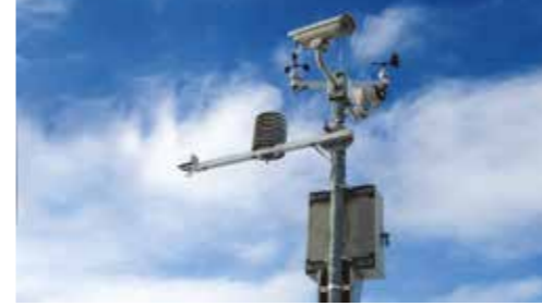
Road Weather CrossMet, METIS Czech Republic