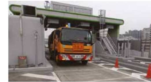
CrossWIM to Protect the Bridges Japan, Osaka